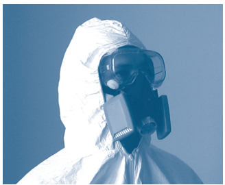
Proper Face Gear

During removal, all workers must be protected from breathing or spreading asbestos fibers by wearing an appropriate respirator, disposable coveralls, goggles, disposable gloves, and rubber boots.