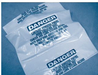
Asbestos Waste Disposal Bag