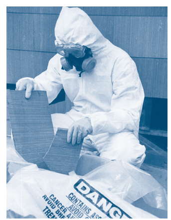
Placing Debris into Cardboard Boxes