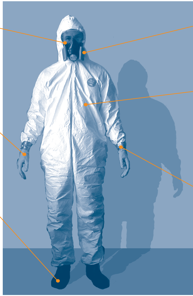
Person in proper protective clothing